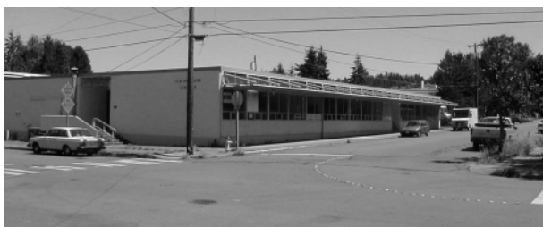
Existing building before remodel