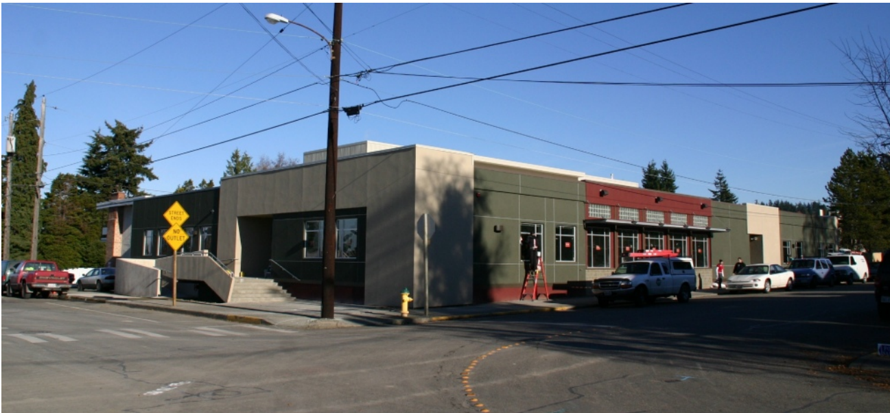
Exterior View from Street