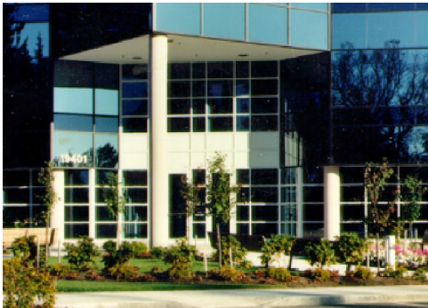
Exterior View At Main Entry