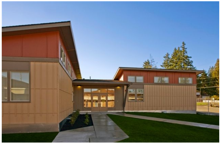
3 Classroom "T" Design