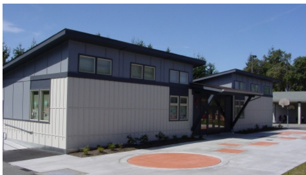
2 Classroom Linear Design

The Shoreline project replaced aging portables with permanent modular buildings at eight elementary school sites. Three prototype floor plans were developed (ranging from 2300 to 3200 SF), and each included classrooms, toilet rooms and emergency storage. Special attention was given to passive cooling and lighting strategies to reduce building life-cycle costs and each plan could be mirrored or otherwise adapted to meet its unique site conditions.