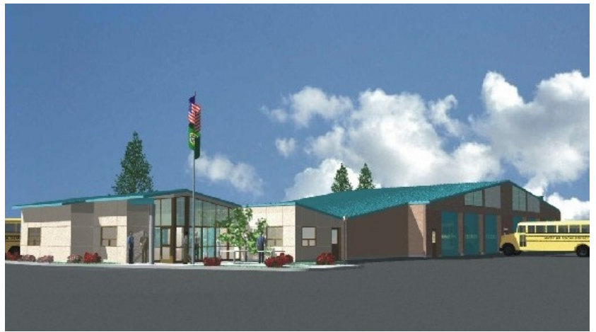
Exterior Computer Rendering

The Transportation Center addition / modernization project included an addition to lengthen the 6 maintenance bays for larger busses, the addition of a storage bay, and an addition for administrative staff. Modernization included new interior and exterior systems, a new metal roof, as well as M&E systems upgrades. The site was also improved to include more bus parking, provisions for heaters, a new fueling area, and a bus wash system.