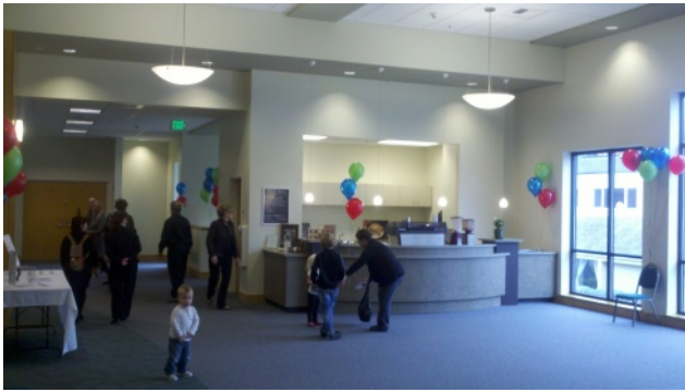
Gathering Space and Coffee Shop