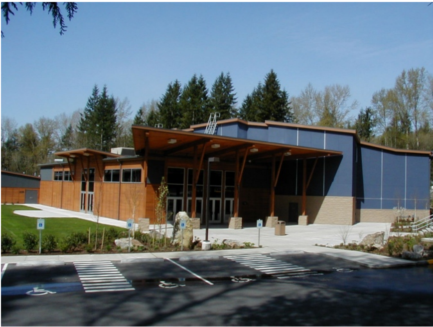
Exterior View at Main Entrance