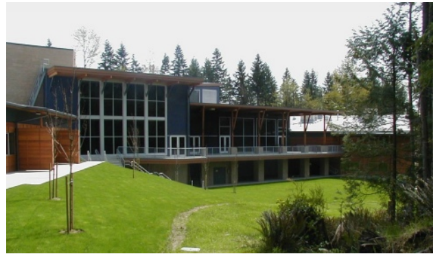
Exterior View at Sanctuary

This is a seeker-sensitive church inspired by contemporary outreach-oriented ministries. The building is designed to be warm and inviting and to look like a community center that will attract people new to the church.