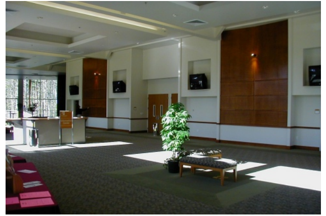
Interior View at Foyer