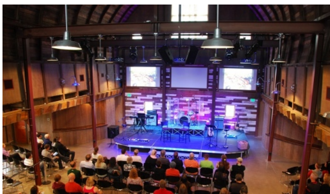
Worship Center Interior

As their first construction project, we helped the church with a design to convert the barn to a worship center. What a unique and exciting project this was, working with the church and King County Landmarks Board to come up with a solution that is sensitive to the historic landmark while updating it to function as a contemporary worship center.